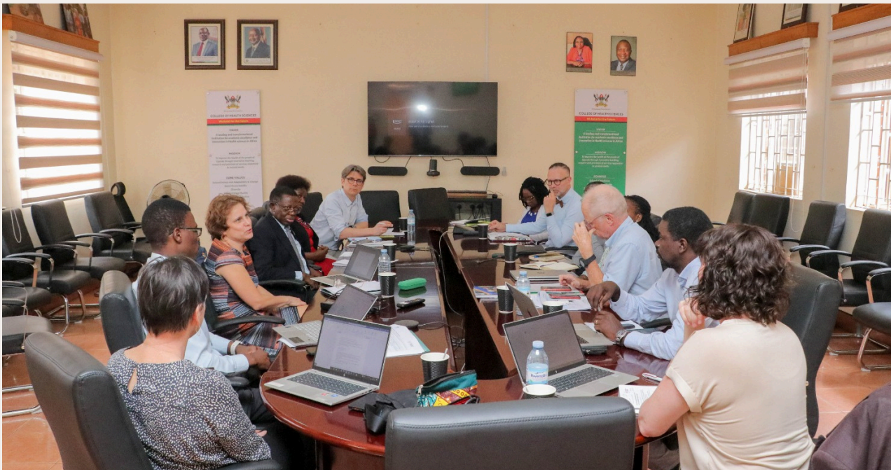
Meeting at the School of Public Health, Makerere University in February 2024