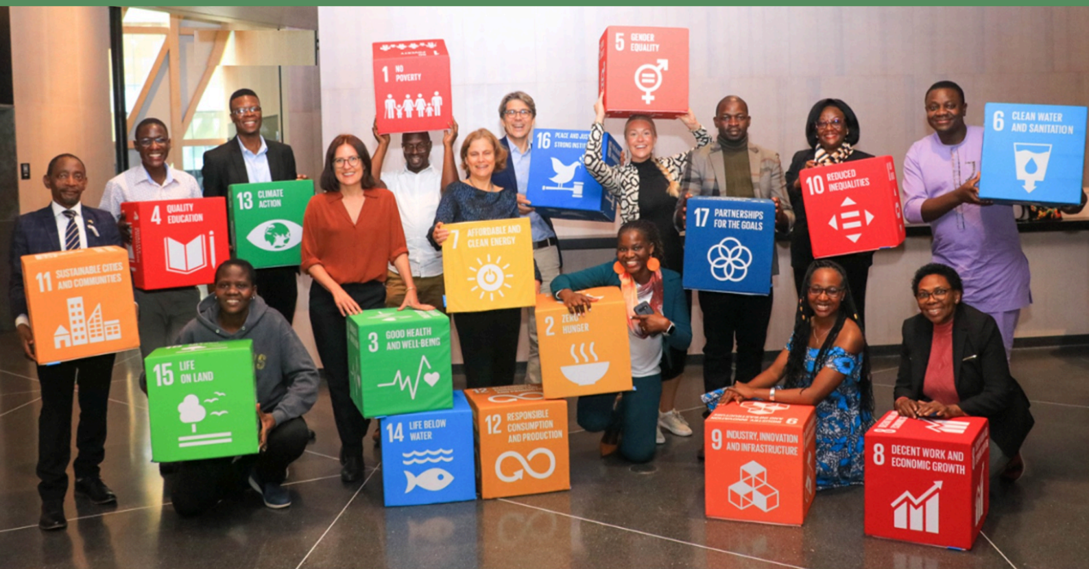
Team at Karolinska Institutet in 2023