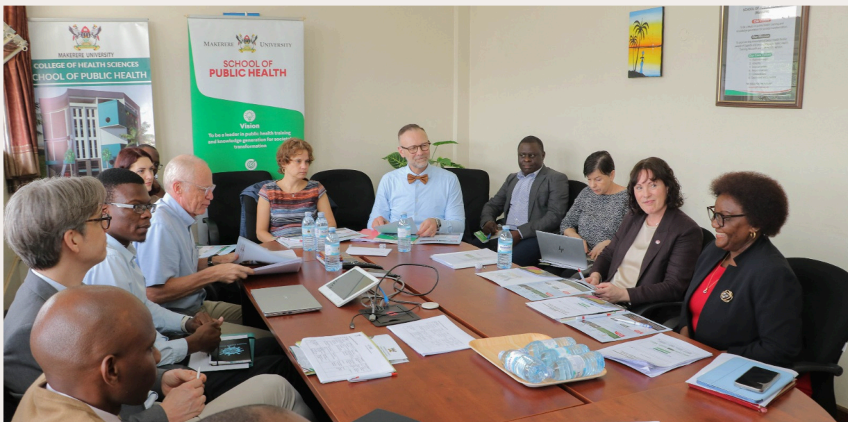
Meeting at the School of Public Health, Makerere University in February 2024